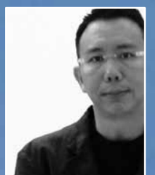
Thomas Kong Architecture, Interior Arch & Designed Obj (USA)