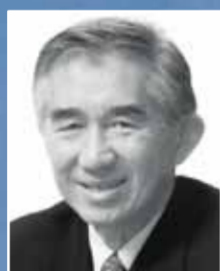
Dr Liu Thai-Ker RSP Architects Planners & Engineers (Singapore)