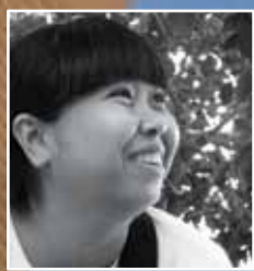
Patama Roonrakwit Community Architects for Shelter & Environment (Thailand)