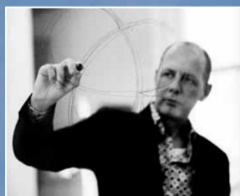
Ben van Berkel UN Studio (Netherlands)