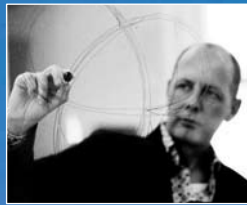
Ben van Berkel UN Studio (Netherlands)