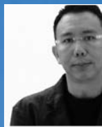
Thomas Kong Architecture, Interior Arch & Designed Obj (USA)