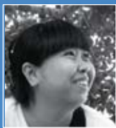
Patama Roonrakwit Community Architects for Shelter & Environment (Thailand)